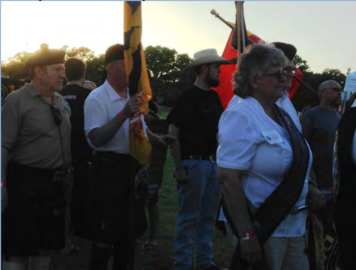
Patiently awaiting calling of the clans